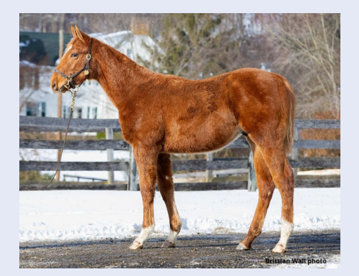
Jimmy Creed colt out of Fifteen Moons Maryland-bred/Virginia-Certified