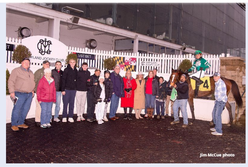
Enabler, by Divining Rod