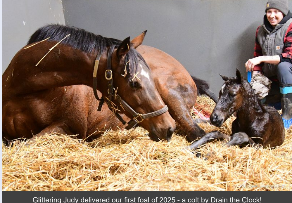
Tune in to our livestream every night on YouTube (link below)