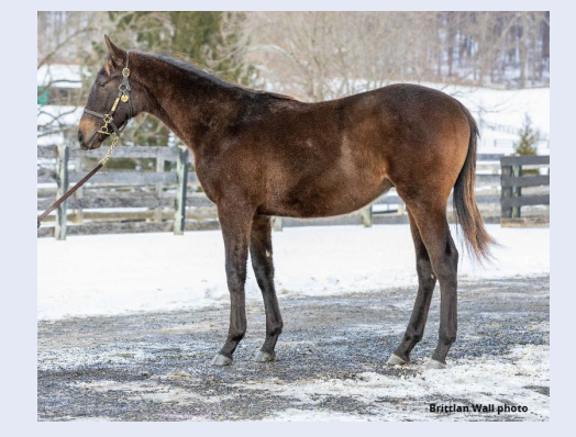
Take Charge Indy colt out of Miss Nondescript Virginia-bred